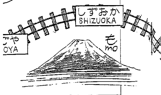
UNIT 5 - JAPANESE STAGE A